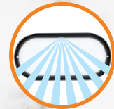
110° Beam Angle