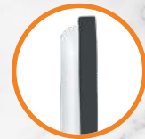
IP54 - Slim Elegant Design