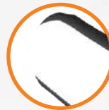
Bright Uniform Light